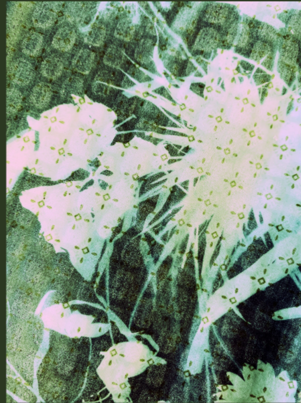
Manipulating materials without changing their structure or composition