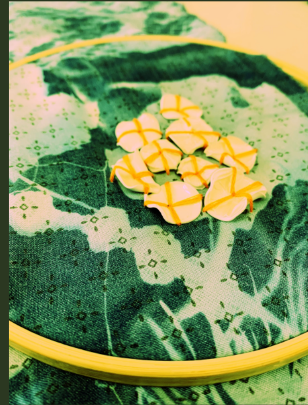
Forming to create a new material.