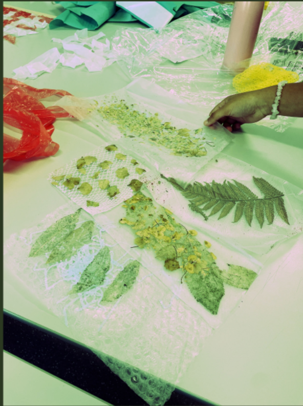
Transforming by altering the structure